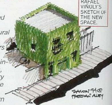
OUT OF THE BOX RAFAEL VIÑOLY'S SKETCH OF THE NEW SPACE.