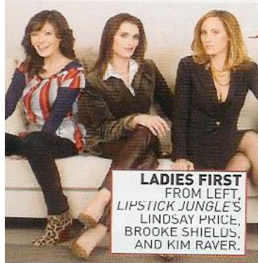
LADIES FIRST FROM LEFT, LIPSTICK JUNGLE'S LINDSAY PRICE, BROOKE SHIELDS, AND KIM RAVER.